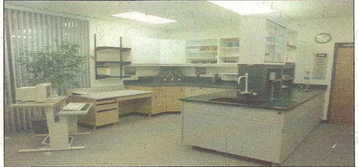
The Laboratory Casegoods section of the showroom

Our Showroom is constantly evolving, as new products and components are added or changed. A library of finishes and styles can be reviewed and compared. An array of ergonomic components, such as monitor supports, keyboard arms, under glass monitor supports and adjustable height tables, to name a few, are set up for hands-on comparisons. Casegoods and work surface details are all on display.