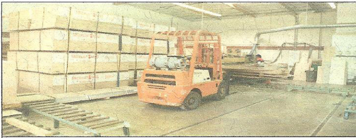
Raw sheet stock ready for processing.